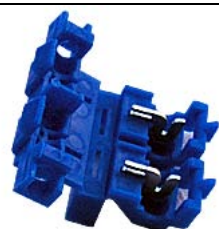
CABLE JOINT with holder for flat fuse