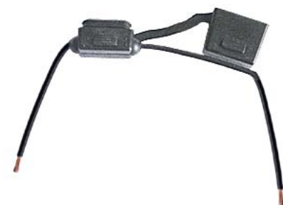
WATERPROOF FUSE HOLDER For mini fuses up to 30 amp